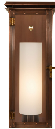
Shown in antique copper / clear

Our Hyland Flush lantern is designed for flush wall installation, offering a clean architectural profile ideal for entries, porches, and sheltered outdoor corridors. Handcrafted from solid copper, it provides electric illumination and delivers dependable performance in any climate.