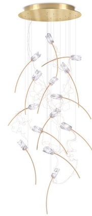
Shown in brass / transparent

COLOR RENDERING . . . . . 90 CRI LAMP COLOR . . . . . 3000K Warm Dim LUMENS/WATT . . . . . 1,968.75 LUMINOUS FLUX . . . . . 6300 lumens