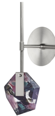
Shown in brushed silver / flamingo mint fragmentglass

PRODUCT DIMENSIONS . . . . . Backplate: 5.7" diameter COLOR RENDERING . . . . . 90 CRI LAMP COLOR . . . . . 2700K LUMENS/WATT . . . . . 83.33 LUMINOUS FLUX . . . . . 100 lumens