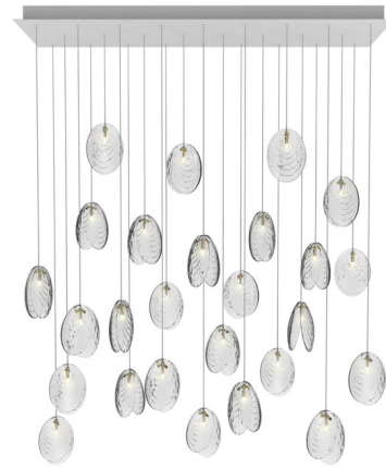
Shown in brushed gold / clear

COLOR RENDERING . . . . . 90 CRI LAMP COLOR . . . . . 2700K LUMENS/WATT . . . . . 2,166.67 LUMINOUS FLUX . . . . . 2600 lumens