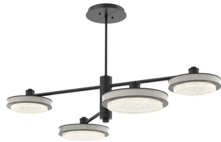
Shown in matte black / light oak wood

COLOR RENDERING . . . . . 93 CRI LAMP COLOR . . . . . 3000K LUMENS/WATT . . . . . 349.70 LUMINOUS FLUX . . . . . 2885 lumens