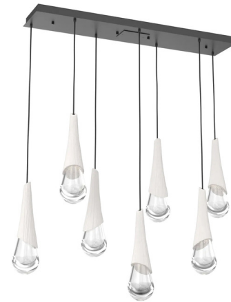
Shown in matte black / chalk

PRODUCT DIMENSIONS . . . . . Adjustable Cloth Cable Lengths: 120" COLOR RENDERING . . . . . 93 CRI LAMP COLOR . . . . . 3000K LUMENS/WATT . . . . . 79.51 LUMINOUS FLUX . . . . . 2942 lumens