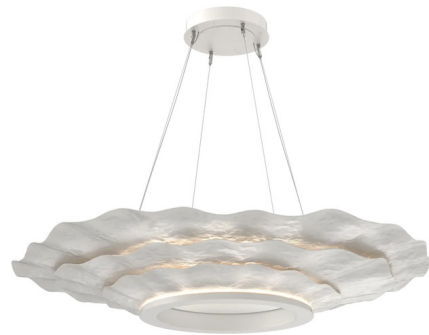
Shown in salt white