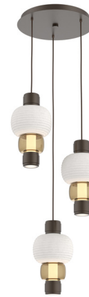
Shown in flat bronze / bronze glass / chalk ceramic

PRODUCT DIMENSIONS . . . . . Adjustable Cable Lengths: 120" COLOR RENDERING . . . . . 93 CRI LAMP COLOR . . . . . 3000K LUMENS/WATT . . . . . 268.42 LUMINOUS FLUX . . . . . 2550 lumens