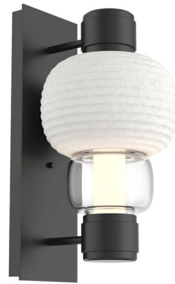
Shown in matte black / clear

The Torno Mandrel Wall Sconce adds a striking simplicity to your interior space. Its capped frame surrounds a glowing cylinder, featuring a ring of glass paired with a larger textured, ribbed ceramic ring. These elements diffuse a warm, ambient light that casts soft, inviting shadows throughout your room. Dimmable with Triac (standard) or Low Voltage Electronic Dimmers, sold separately.