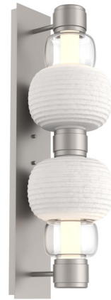
Shown in beige silver / clear

The Torno Mandrel Double Wall Sconce adds a striking simplicity to your interior space. Its capped frame surrounds a glowing cylinder, featuring rings of glass paired with larger textured, ribbed ceramic rings. These elements diffuse a warm, ambient light that casts soft, inviting shadows throughout your room. Dimmable with Triac (standard) or Low Voltage Electronic Dimmers, sold separately.