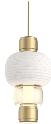
Shown in gilded brass / amber

The Torno Mandrel Pendant brings the natural beauty of a perfect raindrop to your interior space. This ethereal design fuses thick artisan hand blown glass, with a sculptural offset ceramic colored accent, casting warm shadows of light across your room. The result is an eye catching piece, wherever it is placed. Adjust each pendant to create you own unique look. Note: Dimmable with Triac (standard) or Low Voltage Electronic Dimmers, sold separately. Sloped ceiling compatible to 45 degrees one way.