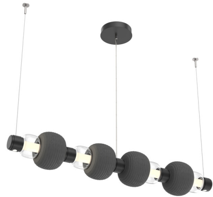
Shown in matte black / clear

PRODUCT DIMENSIONS . . . . . Adjustable Cable Lengths: 120" COLOR RENDERING . . . . . 93 CRI LAMP COLOR . . . . . 3000K LUMENS/WATT . . . . . 400.00 LUMINOUS FLUX . . . . . 4900 lumens