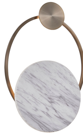
Shown in brushed champagne gold / marble