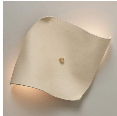
Shown in bone

Inspired by the soft waves of a sailcloth, the Shan Ceiling Light / Wall Sconce transforms the ceiling into a canvas of quiet minimalism. Its origami-like ceramic form creates an interplay of light and shadow overhead or when used as a wall sconce. Perfect for adding a warm glow in a bedroom, bringing character to a hallway, or adding style to a mudroom. METALLIC GLAZE AGING AND VARIATION The Obsidian and Graphite glazes contain reactive metallic compounds that naturally oxidize, causing their hue and sheen to evolve over time. Expect soft mattifying, darker tones, or a gentle reduction in luster, beautiful changes that make each handmade piece uniquely alive. These subtle shifts are part of the glaze's natural character, not flaws.