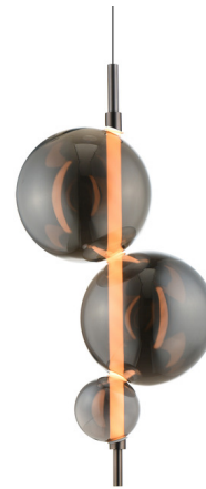
Shown in black chrome / mirror smoke

Drawing inspiration from her acclaimed Dreamcloud experiential design at Art Basel Miami, Nina Magon reinterprets her otherworldly installation for use in the home or hospitality project. The Dreamer Vertical Pendant suspends bubble-like glass forms that appear to float across a channel of LED illumination. Use as a solo standout or hang in clusters for dramatic effect.