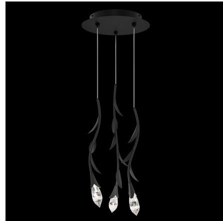
Shown in black / optic haze

The Secret Garden Round Multi Light Pendant brings graceful beauty to your interior space. The smooth, round frame supports gently curved branches with leaf accents, adorned with crystal buds casting a warm, inviting glow throughout your room. Notes: Dimmable with Triac (standard), Low Voltage Electronic, or 0-10V Dimmers, sold separately. Adjust each pendant to create your own unique look. Driver is concealed within the canopy. Due to the weight of the 21 light fixture, additional ceiling support is required.