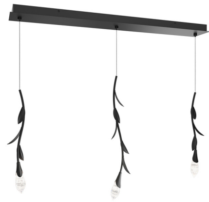
Shown in black / optic haze

PRODUCT DIMENSIONS . . . . . Min/Max Adjustable Overall Height: 35" - 160" COLOR RENDERING . . . . . 90 CRI LAMP COLOR . . . . . 3500K LUMENS/WATT . . . . . 278.67 LUMINOUS FLUX . . . . . 836 lumens