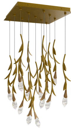
Shown in french gold / optic haze

PRODUCT DIMENSIONS . . . . . Min/Max Adjustable Overall Height: 35" - 160" COLOR RENDERING . . . . . 90 CRI LAMP COLOR . . . . . 3500K LUMENS/WATT . . . . . 1,223.48 LUMINOUS FLUX . . . . . 1407 lumens