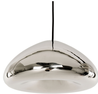
Shown in matte black / steel

COLOR RENDERING . . . . . 94 CRI LAMP COLOR . . . . . 3000K LUMENS/WATT . . . . . 106.67 LUMINOUS FLUX . . . . . 800 lumens