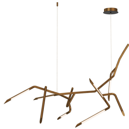
Shown in weathered brass / frost

Full of angular, diverging lines, the Scion Linear Pendant transforms a flowing tree branch into a modern chandelier. Each branch features an acrylic diffuser with a line of bright, even LED illumination. Perfect for a dining room, kitchen, or anywhere you need a touch of geometric whimsy. Dimmable via TRIAC, ELV, or 0-10V dimmers.