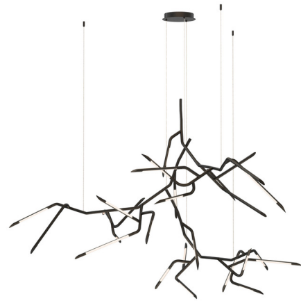
Shown in black / frost

PRODUCT DIMENSIONS . . . . . Cable: 120" LAMP LIFE . . . . . 30000 hours COLOR RENDERING . . . . . 90 CRI LAMP COLOR . . . . . 3000K LUMENS/WATT . . . . . 777.78 LUMINOUS FLUX . . . . . 3500 lumens