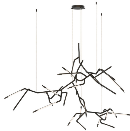
Shown in black / frost

PRODUCT DIMENSIONS . . . . . Cable: 120" LAMP LIFE . . . . . 30000 hours COLOR RENDERING . . . . . 90 CRI LAMP COLOR . . . . . 3000K LUMENS/WATT . . . . . 777.78 LUMINOUS FLUX . . . . . 3500 lumens