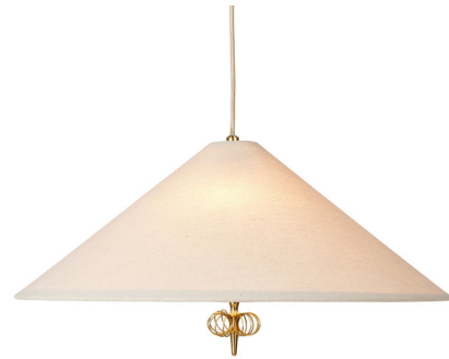
Shown in brass / canvas

With its refined lines and elegant details, the Tynell 1967 Pendant is a classic fixture that helped solidify Paavo Tynell's place as one of the leading designers of the mid-20th century. The 1967 Pendant emits warm, ambient lighting through its conical canvas shade. A fabric diffuser over the bottom of the pendant obscures the light source to reduce glare and adds to the cozy atmosphere. A brass detail beneath the shade adds an elegant touch to complete the look.