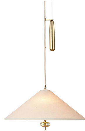
Shown in brass / canvas

COLOR . . . . . Canvas BODY FINISH . . . . . Brass WATTAGE . . . . . 20W DIMMER . . . . . Standard 120V DIMENSIONS . . . . . 22"W x 10.6"H BULB NOT INCLUDED . . . . . 2 x A19/Medium (E26)/10W/120V LED COUNTRY OF ORIGIN . . . . . China