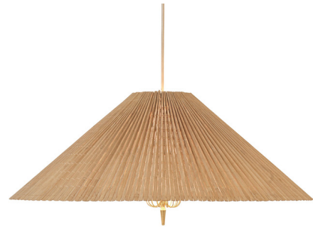
Shown in brass / bamboo

Building upon the design language of Paavo Tynell's 1967 Pendant, the Tynell 1972 Pendant features a conical silhouette made of bamboo slats. The shade is hand-crafted by sewing the bamboo slats into a pleated mat and fastening it to the wire frame with a linen liner in between. A decorative brass detail beneath the shade and a fabric diffuser add a stylish touch and further enhance the pendant's warm expression.