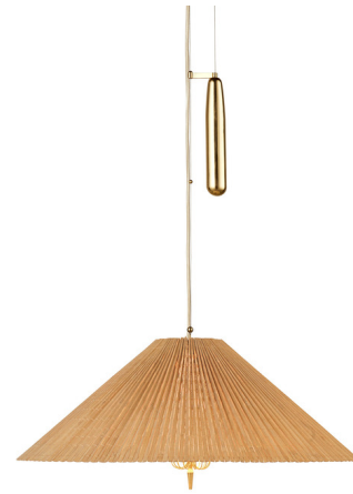
Shown in brass / bamboo

Building upon the design language of Paavo Tynell's 1967 Pendant, the Tynell 1972 Pendant features a conical silhouette made of bamboo slats. The shade is hand-crafted by sewing the bamboo slats into a pleated mat and fastening it to the wire frame with a linen liner in between. A decorative brass detail beneath the shade and a fabric diffuser add a stylish touch and further enhance the pendant's warm expression. The counterweight pulley system allows the height of the pendant to be easily raised or lowered.