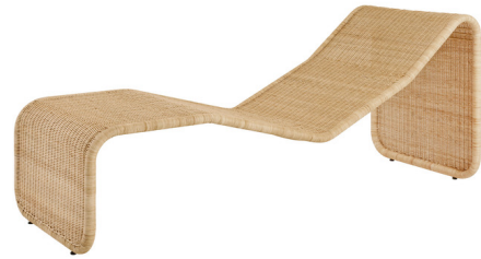
Shown in rattan

Originally designed in 1964 by Tito Agnoli for furniture company Bonancina 1889, the P3S Chaise Longue is an icon of Italian mid-century design. Gubi, working in close collaboration with Bonancina 1889, has now re-issued this classic piece for the modern day. The P3S Chaise Longue is made of handwoven rattan strips fixed to an angular steel frame in a beautiful showcase of the material's natural warmth and texture. While the rattan construction is a nod to P3S's mid-century roots, its sculptural, modern silhouette feels at home in contemporary spaces as well.