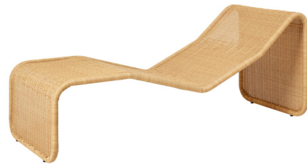
Shown in natural

Originally designed in 1964 by Tito Agnoli for furniture company Bonancina 1889, the P3 Chaise Longue is an icon of Italian mid-century design. Gubi, working in close collaboration with Bonancina 1889, has now re-issued this classic piece for outdoor use. The P3S Outdoor Chaise Longue is made of high density polyethylene strips fixed to an angular steel frame to recall the look of the original's handwoven rattan construction with added durability and weather resistance. While this look is a nod to P3's mid-century roots, its sculptural, modern silhouette feels at home in contemporary spaces as well.