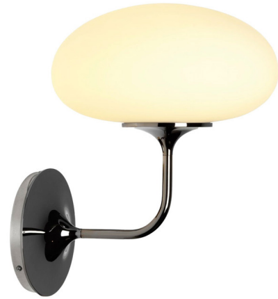
Shown in black chrome / opal

Originally designed by Bill Curry in 1962, the Stemlite lamp series was the first total look lamp, which replaced the traditional base-and-shade design with a single, self-contained unit. The StemliteWall Sconce is Gubi's take on remastering this classic design for the modern era. Featuring an opal glass diffuser atop a slim stem, Stemlite will add a touch of mid-century style to any interior. Rotary dimmer switch located beneath shade.