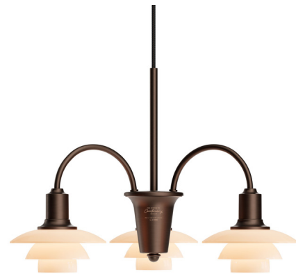
Shown in aged brass / dusty terracotta

PRODUCT DIMENSIONS . . . . . Cord Length: 156"