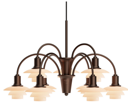
Shown in aged brass / dusty terracotta

Part of Poul Henningsen's reflective PH collection originally developed in 1926, the PH 1/1 Chandelier was a part of Louis Poulsen's catalog from 1933 to the mid-1960s. Featuring the iconic tiered round shades of the PH collection in Dusty Terracotta glass, the PH 1/1 Chandelier features a curving arm to support each light source. In honor of the PH collection's 100th anniversary, the PH 1/1 Chandelier has been re-released in this special edition. Each fixture is engraved with a unique number to commemorate this historical run.