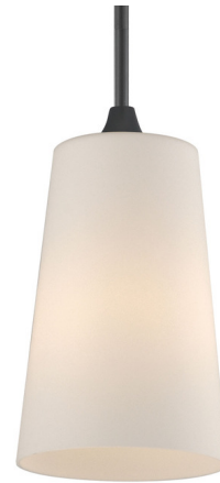
Shown in black / satin white

PRODUCT DIMENSIONS . . . . . (1) 6" (3) 12" Stem Kit Included