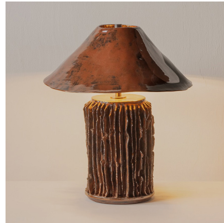
Shown in rust ceramic

Christopher Merchant's Silo Wide Table Lamp explores the balance between structure and organic form. Repeating vertical ridges along the ceramic base create a sense of geometric order, with subtle variations in contour and glaze that give the lamp a natural, fluid character. A matching A-line shade provides a complementing touch. A dimmer switch is located on the cord.