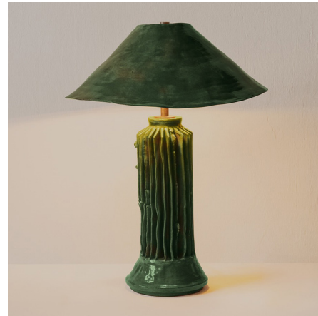
Shown in forest green ceramic

Christopher Merchant's Slim Silo Table Lamp explores the balance between structure and organic form. Repeating vertical ridges along the ceramic base create a sense of geometric order, with subtle variations in contour and glaze that give the lamp a natural, fluid character. A matching A-line shade provides a complementing touch. A dimmer switch is located on the cord. Please Note: Subtle variations in glaze and shape are to be expected.