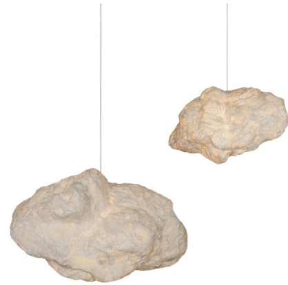
Shown in cream

Cloud Hanging Lamp features cotton fiber spun like fairy floss held into shape by seemingly weightless wire armatures, then lacquered for rigidity. The diaphanous frame is stronger than appears and can be reshaped if accidentally bumped. Each cloud is handcrafted and may look slightly different, adding to the charm.