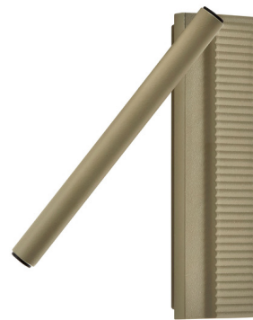
Shown in olive grey

COLOR RENDERING . . . . . 90 CRI LAMP COLOR . . . . . 2700K LUMENS/WATT . . . . . 171.43 LUMINOUS FLUX . . . . . 360 lumens