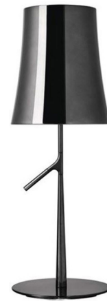
Shown in graphite

The Birdie Table Lamp is inspired by nature. The slim stem recalls the trunk of a tree, while the branch, as if ready for a bird to land, allows you to turn the lamp on or off. Whether beside an armchair or a sofa in the living room, on the desk in the study, on a bedside table, or in any other room of the house, Birdie fits in naturally and accompanies everyday life with a pleasantly stylish presence. Simply touch the branch to change the light. On/Off switch - located on the cord, or a Touch Dimmer.