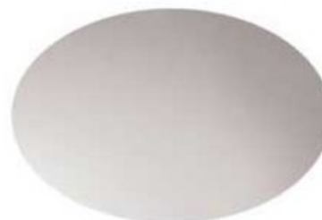
Shown in: White/ Haze Dome

Aurora Dual Halogen 3.3 Inch Round Edge Trimless Downlight with Housing is a specification grade, adjustable accent fixture for plaster or drywall construction. Two 12 volt MR16 37 watt IR maximum, or two MR16 LED 12 volt 7 watt bulbs, one per socket, are required, but not included. The flush mounted rigid plaster plate, which is finished into the ceiling, maintains a flat finish and defines the Truly Trimless Pure edge (knife edge) 3.3 inch aperture. Combined with the Aurora dome and the tilt gear hidden behind the lamp creates a clean internal lock. Features hot aiming with Philips screwdriver offering 20 to 45 degree vertical adjustment and 362 degree horizontal rotation without beam clipping. Includes standard 120 volt magnetic transformer, IC and air-tight, suitable for remodel or new construction. Secondary output voltage is 11.8 volts. Designed to accommodate ceiling thickness from .50 to 1.25 inches. Dome features anodized soft haze finish and hides electrical hardware, tilting for easy access to junction box and transformer. Includes two snoots and soft focus lenses, with room for two bulbs and two additional accessories. Aurora Gear Cover and light control accessories sold separately.