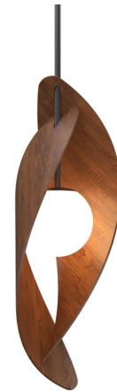
Shown in black / imbuia

PRODUCT DIMENSIONS . . . . . Adjustable Cable Lengths: 120"