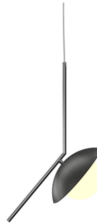
Shown in lead grey / charcoal

The Oyster Pendant brings a sense of elegance to your interior, drawing inspiration from the natural beauty of the sea. The angled arm holds a gracefully dome of wood veneer that cradles a pearl like glass globe, diffusing a warm, ambient glow that casts soft shadows of light throughout your room.