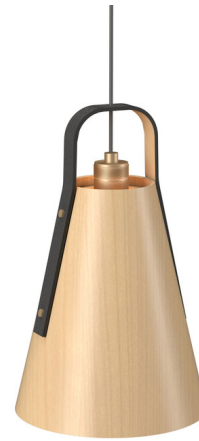
Shown in maple / black leather

The Strap 1527 Pendant brings rustic farmhouse charm to your interior space. Its natural wood veneer cone shaped shade is complemented by an elegant arched strap wrapped in leather, casting a soft, inviting glow of light and shadow throughout your room. Note: Socket is Brass. Arch has Black Leather, except for the Charcoal finish that has Brown Leather.