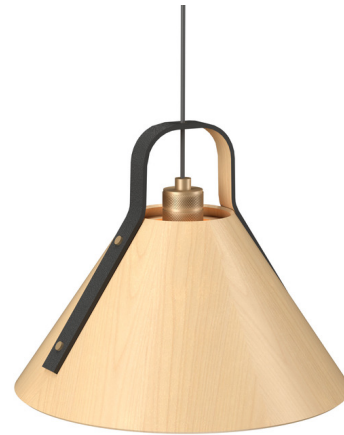
Shown in maple / black leather

The Strap 1528 Pendant brings rustic farmhouse charm to your interior space. Its natural wood veneer cone shaped shade is complemented by an elegant arched strap wrapped in leather, casting a soft, inviting glow of light and shadow throughout your room. Note: Socket is Brass. Arch has Black Leather, except for the Charcoal finish that has Brown Leather.