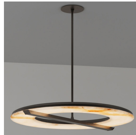
Shown in bronze / honed alabaster