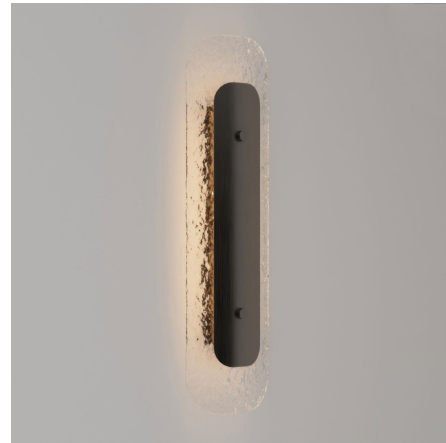
Shown in antique bronze / clear kiln glass

The Contour Wall Sconce offers a stunning focal point with its combination of refined proportions and rich texture. A kiln glass diffuser evokes the texture of tree bark and gently diffuses light from the integrated LED light source. The glass is paired with patinated metal accents to create a dazzling interplay of light and shadow. Includes 4.5 inch square mounting plate for US junction box.