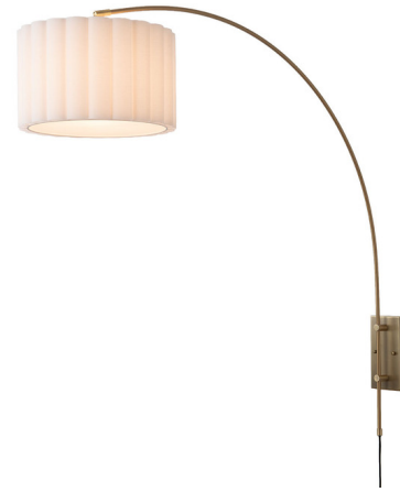
Shown in weathered brass / white linen

LAMP LIFE . . . . . 25000 hours COLOR RENDERING . . . . . 90 CRI LAMP COLOR . . . . . 2700K LUMENS/WATT . . . . . 107.14 LUMINOUS FLUX . . . . . 1500 lumens