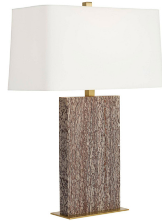
Shown in dark wood vein / off white

The Uriah Table Lamp is distinguished by its clean, elongated silhouette, accented with warm metal detailing that enhances its refined profile. Subtle variations in texture create a sense of movement and depth, highlighting the lamp's architectural form. Sculptural yet understated, this elegant table lamp brings quiet strength, sophisticated texture, and timeless appeal to living spaces, entryways, and thoughtfully designed interiors. Three-way rotary switch is located on the lamp socket.