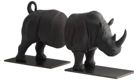
Shown in charcoal

The Etosha Bookends draw inspiration from the powerful form of the rhinoceros, embodying a sense of strength, permanence, and natural beauty. Crafted from a charcoal lava stone composite, each piece showcases a richly textured, porous surface that reflects its rugged origins. Sculptural and substantial, this distinctive set brings depth and character to bookshelves and consoles, grounding contemporary interiors with an organic presence.