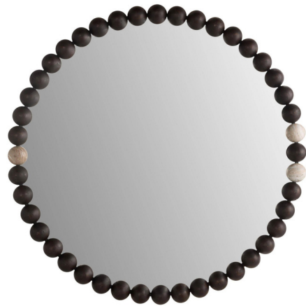
Shown in sable / mirror

The Sautoir Wall Mirror is defined by a sculptural frame of repeating spherical forms, meticulously crafted in sable-finished mango wood. The rich, dark surface is accented by two contrasting stone spheres that gently interrupt the rhythm of the design, adding depth, texture, and visual intrigue. With its generous scale, the mirror becomes a striking focal point enhancing light and presence in the room while introducing a refined interplay of geometry and subtle contrast. Includes hanging hardware.