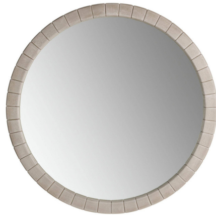
Shown in smoke / mirror

The Makeda Mirror draws inspiration from the rhythmic geometry of a handcrafted wooden necklace, translating its distinctive form into a sculptural statement piece. Crafted from mango wood and finished in a weathered smoke tone, the frame beautifully showcases the material's natural grain and character. Defined by clean, block-like segments and rich tactile texture, the Makeda balances artisanal craftsmanship with modern refinement, bringing warmth, depth, and understated elegance to any interior. Includes hanging hardware. Note: The weight of this mirror is 121 pounds.