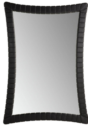
Shown in ebony / mirror

The Levant Mirror is distinguished by a rhythmic arrangement of hand-carved elements that evoke the look of an oversized wooden necklace. Crafted from ebony-finished mango wood, its rich, dark tone accentuates the sculptural form and intricate craftsmanship. Both artistic and architectural, the Levant brings warmth, texture, and a striking sense of dimension to any space. May be mounted horizontally or vertically. Includes hanging hardware.