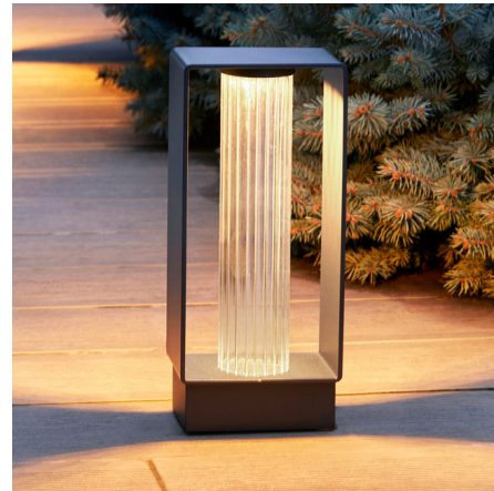
Shown in anthracite / transparent

COLOR RENDERING . . . . . 90 CRI LAMP COLOR . . . . . 2700K LUMENS/WATT . . . . . 116.94 LUMINOUS FLUX . . . . . 725 lumens